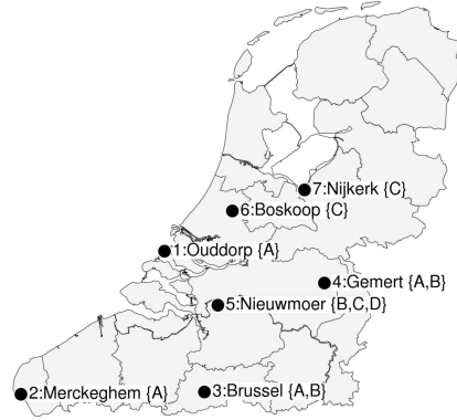
Figure 1. This SAND1 sample marks the occurrences in seven dialects (1-7) of the syntactic variables (A-D) in Tables 1 to 4.