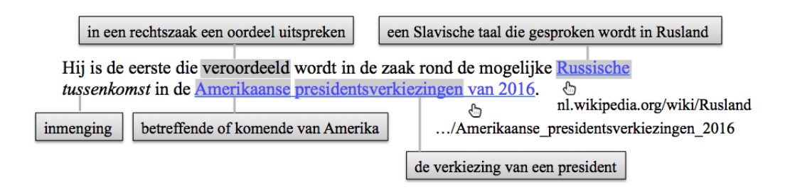
Figure 2: Example of annotated html output

Figure 2 shows an example of the system's output in html format. One word was changed ( inmenging \rightarrow tussenkomst - interference \rightarrow intervention ). The replacement word is shown in italics, and the replaced word appears as hover text. Definitions for four words are also available when hovering over them. This is indicated by gray shading. Finally, two Wikipedia links are added, one of which to a 4-word sequence. An example of the html code generated by the simplification system is provided in Appendix D.